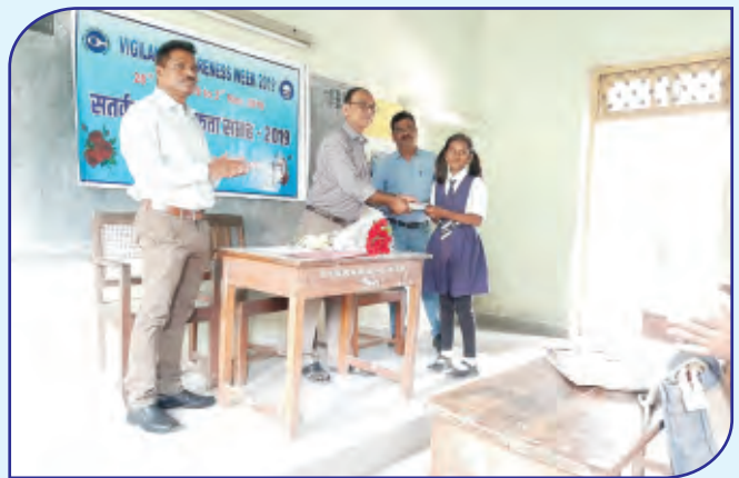
Prize Distribution of Essay Competition at Zilla Parishad High School, Nagpur