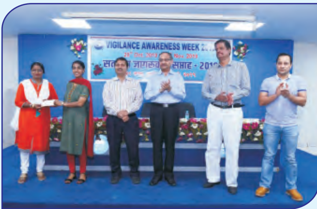
Prize Distribution of Quiz Competition at H.O., Nagpur