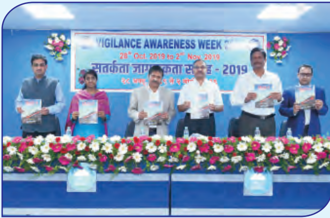
8 th Edition of Annual Vigilance Magazine“Shuchita”