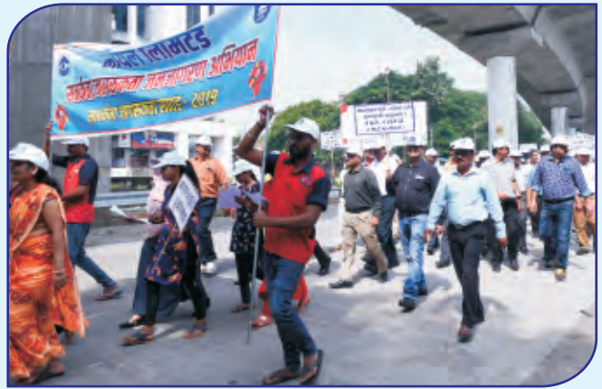
Vigilance Awareness Week Rally–31 st October 2019