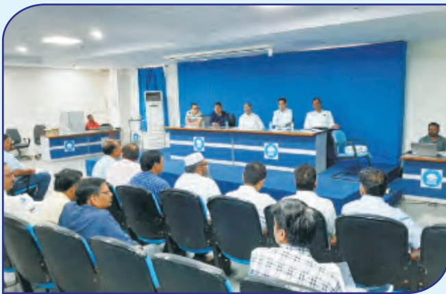
Quarterly Structured Meeting with Management 05.10.19